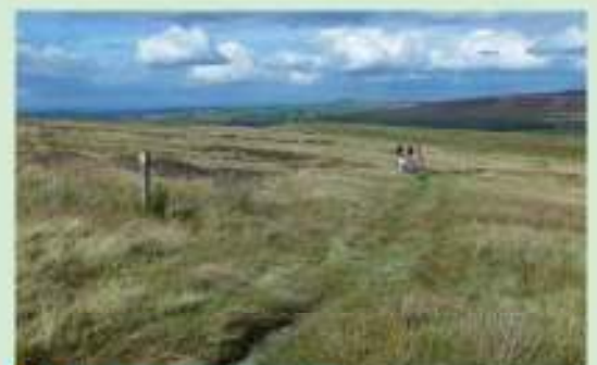
3 Walkers on the Black Way