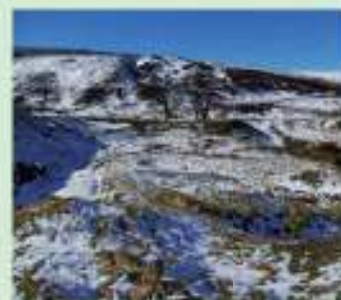
5 Coalcleugh in winter