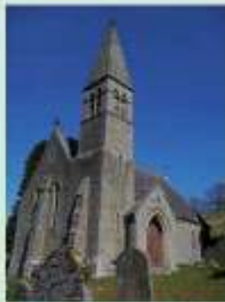
12 Ninebanks Church