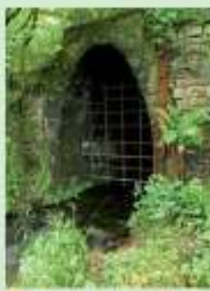
10 Blakett Level