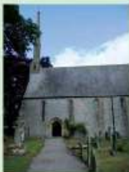
10 Kirkhaugh Church