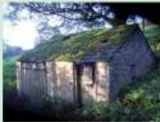
11 Hearse House