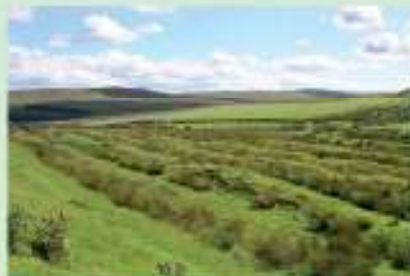
9 Whitley Castle Roman Fort (Epiacum)