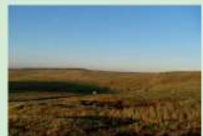
4 Rushynea and The States