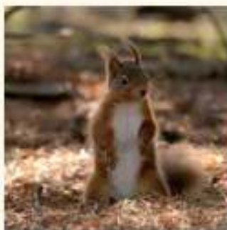
Red squirrel