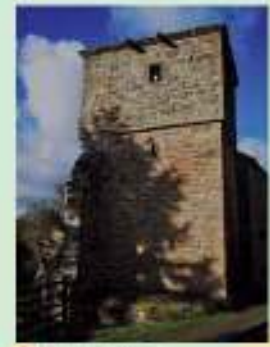
13 Peel Tower