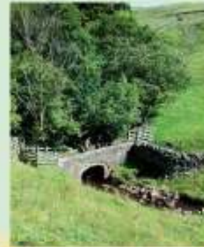
11 Bridge over Dry Burn