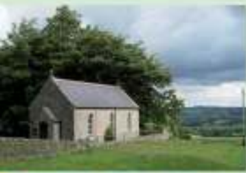
5 Wesleyan Chapel, Keenley