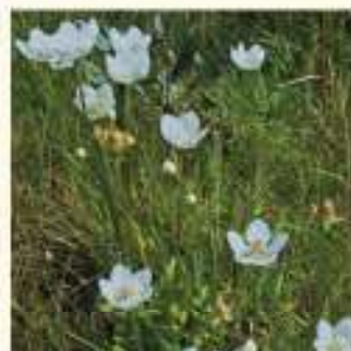
Grass of Parnassus