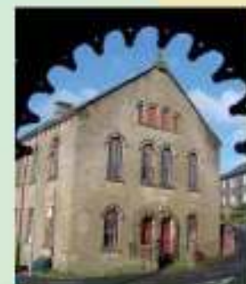
7 Wesleyan Chapel, Nenthead