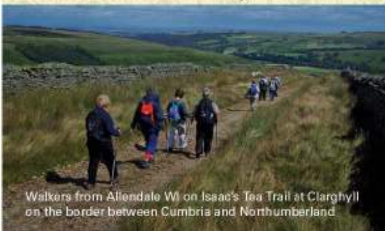
Walkers from Allendale WI on Isaac's Tea Trail at Clarghyll on the border between Cumbria and Northumberland