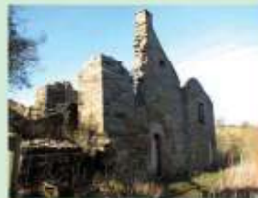
2 Rowantree Stobb bastle